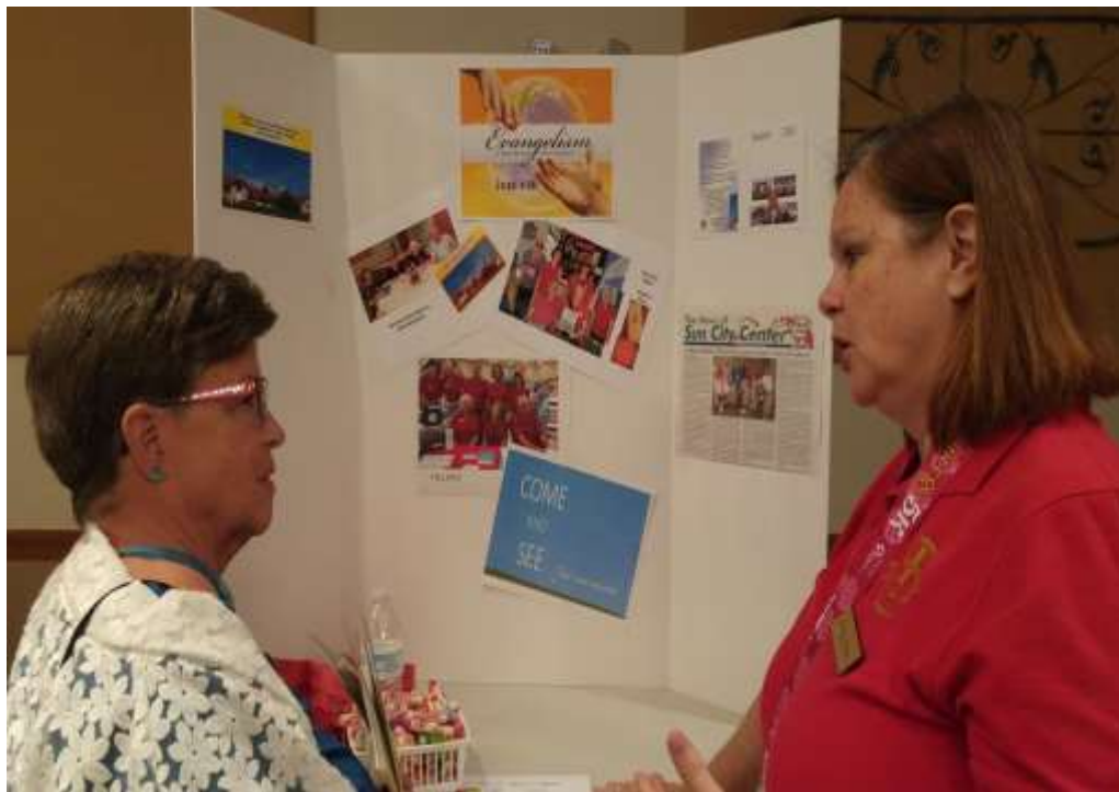
EVANGELISM TABLE AT THE MINISTRY FAIR