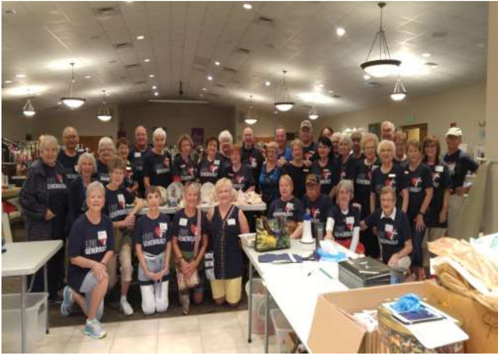
RUMMAGE SALE CREW 2018