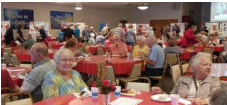
Members & friends of Redeemer at the Ministry Fair.