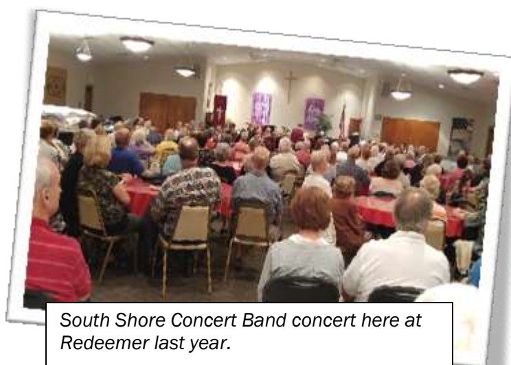
South Shore Concert Band concert here at Redeemer last year.