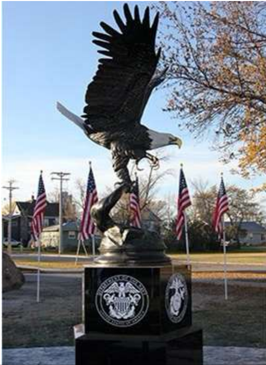
Above is an example of the eagle and granite monument that will be part of the Veteran's memorial here in Sun City Center.

Have you heard the news that the Sun City Center Charitable Foundation, Inc. in cooperation with local military and community are planning the construction of a Veterans' Memorial in Sun City Center? It is going to be located in front of the SCC Community Hall on Pebble Beach Blvd. S. Engraved bricks are being sold in two sizes: $100 for a 4x8-inch brick and $200 for an 8x8-inch square brick. The Memorial will honor our past, current and future male and female veterans and their families while at the same time promoting civic pride. Benevolence monies collected throughout the month of July will be used to purchase a brick for the Veteran's Memorial and help with the costs of building and maintaining the memorial. What a great way to show our love and support and let others know about Redeemer Church this way!