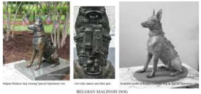
Above is an example of the war dog that is being sculpted for the Veteran's memorial here in Sun City Center.

completion date to be met. A black granite monument is coming from India; a bronze eagle is coming from Baltimore, and a war dog "Warlock" is being sculpted by an artist in Salt Lake City. Construction teams will be needed for the job, but since this is a smaller scale job it will likely fall behind larger jobs these companies may have. The memorial will have a total of 8,000 bricks along with 7 flags (U.S., 5 service flags, and a Florida State flag). As of the end of May 350 engraved bricks have been sold. Sun City Center Charitable Foundation would love to have every business, church, club, resident and organization show their support by contributing something to the success of this memorial. Brick orders can be made online at charitablefoundationscc.org or with a printed order form.