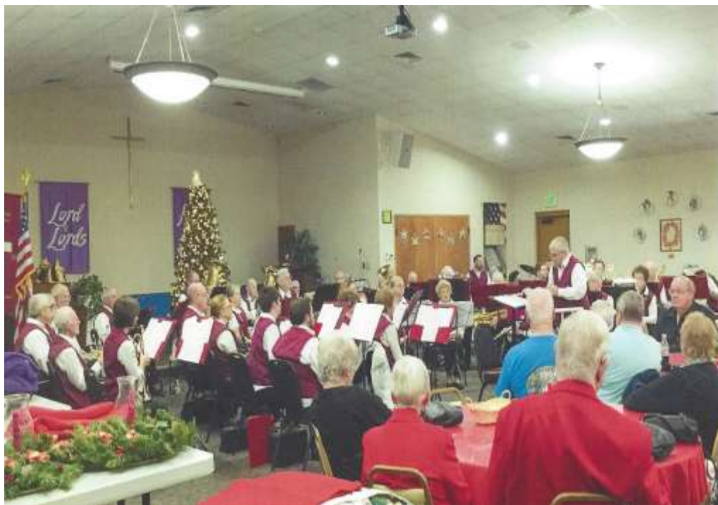
SOUTH SHORE CONCERT BAND 2018