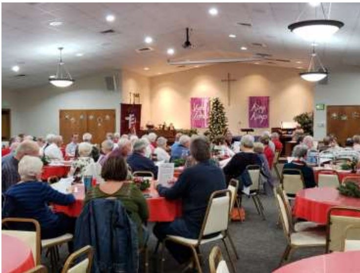
The merry crowd getting in the holiday spirit of Christmas.