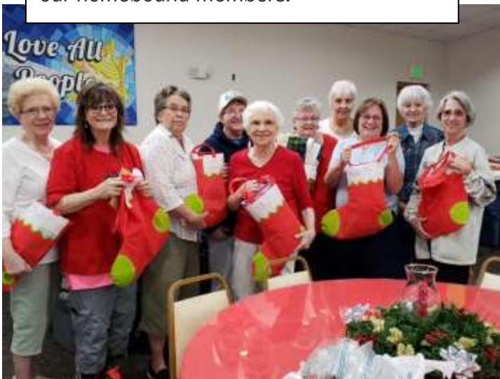
Sunshine crew ready to deliver cookies to our homebound members.