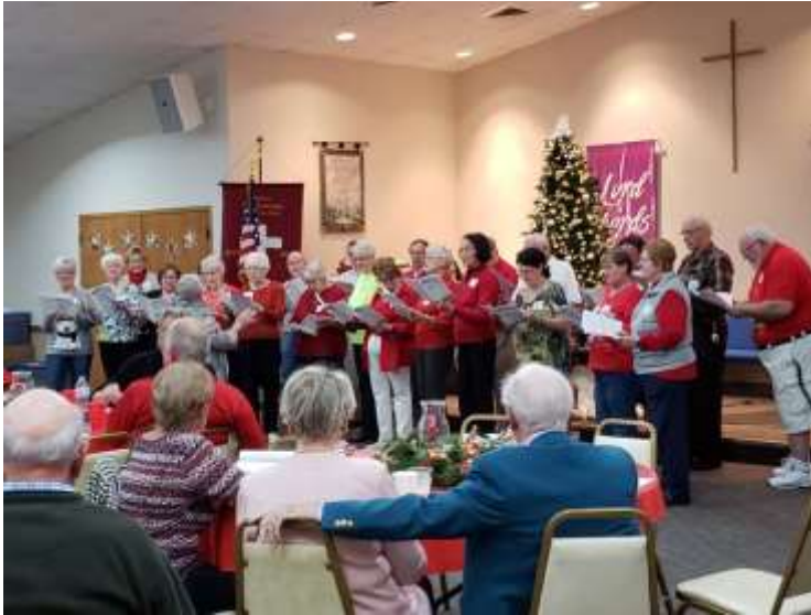
Redeemer Choir members singing at the Christmas Cheer & Carols event.