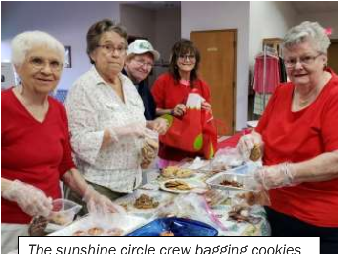
The sunshine circle crew bagging cookies for gift bags. (above)

Thanks to those who baked cookies, assembled the gift bags which this year were big stockings, and delivered them to the home bound. The many helping hands were greatly appreciated.