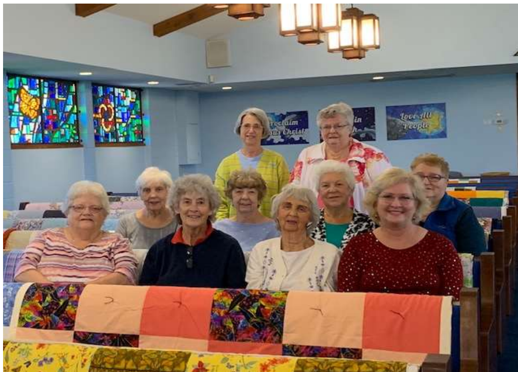
WE LOVE OUR QUILTERS GROUP