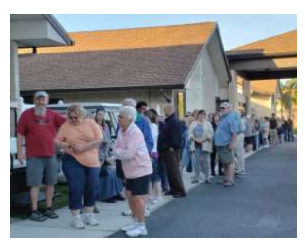
Rummage Sale line starting at Buhr and goes the other doors.

Friday morning the volunteers showed up, the parking lot was full, and the customers came. We had a line until around 10:30 AM. Sales were great. Saturday was a slower day but the tables became empty. We had the quilt drawing at 11:30 AM. The last hot dog was served. At noon we closed our doors. The remaining volunteers stayed to clean up. Buhr Hall was set for Fellowship.