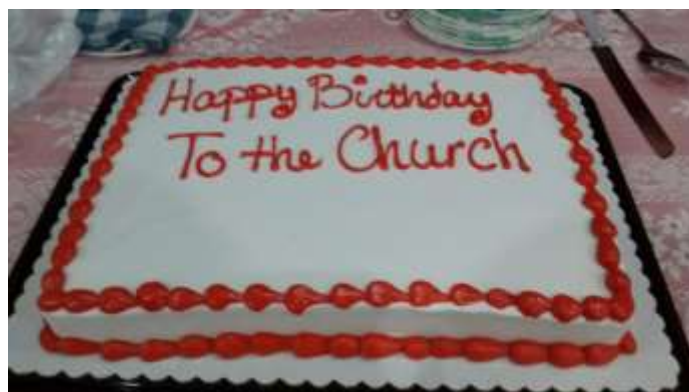
The delicious cake enjoyed during fellowship