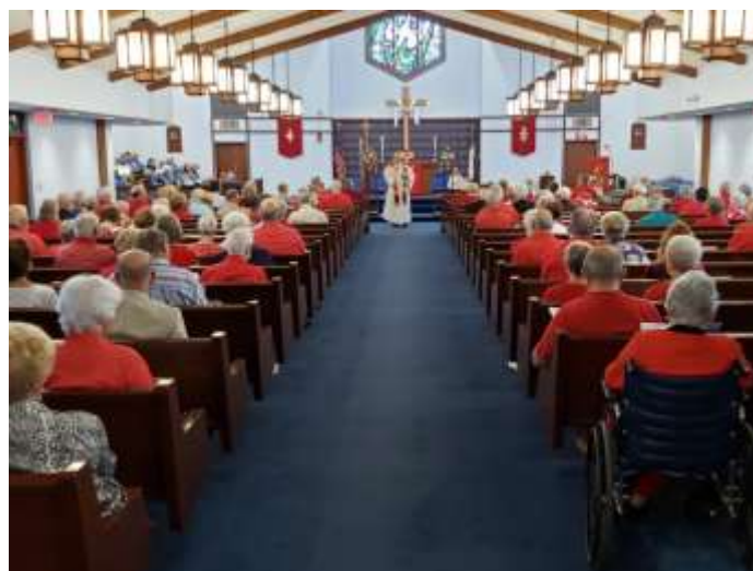
Everyone is looking great in red on Pentecost Sunday