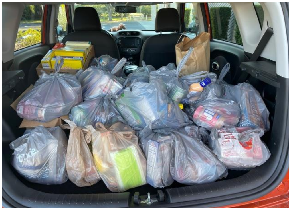
DECEMBERS FOOD PANTRY DONATION