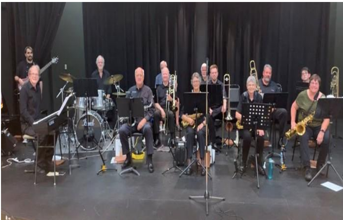
Riverside Jukebox Swing Band

A freewill offering will be collected. We also ask that you bring a non-perishable food item for donation to the local food pantry.