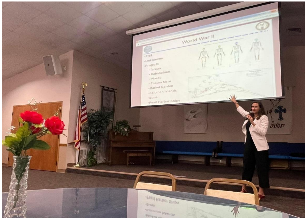
DPAА PRESENTATION ON 22 FEBRUARY 2023