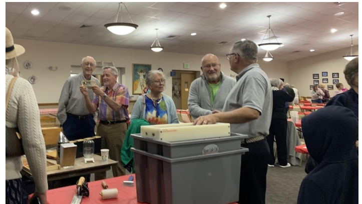
Bee boxes and more